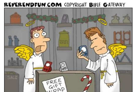
12-07-2012 I WANT TO GET GOD SOMETHING AWESOME FOR CHRISTMAS THIS YEAR, BUT WHAT DO YOU GET THE GUY WHO MADE EVERYTHING?